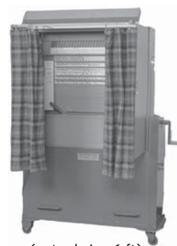
(actual size 6 ft)

Education programs are sponsored in part by: Accenture, Chartwell Charitable Foundation, Chevron Corporation, The Eli and Edythe Broad Foundation, Morongo Band of Mission Indians, Pacific Gas and Electric Company, San Manuel Band of Mission Indians, The Women's Conference