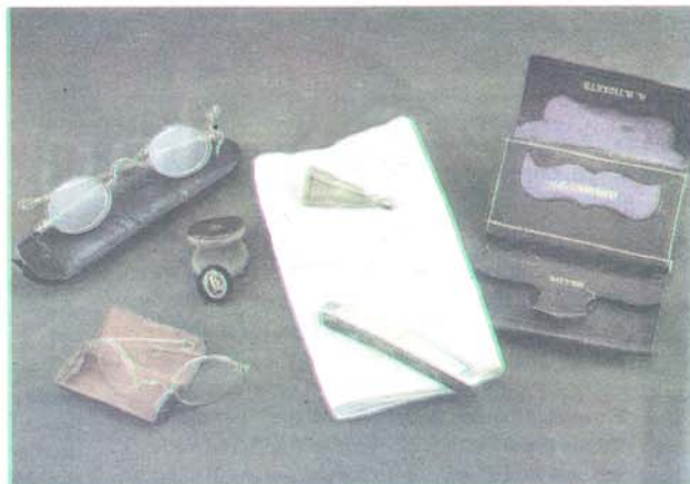
The contents of Abraham Lincoln's pockets on the night of his assassination will be on display in "With Malice Toward None: The Abraham Lincoln Bicentennial Exhibition" at the California Museum this summer.