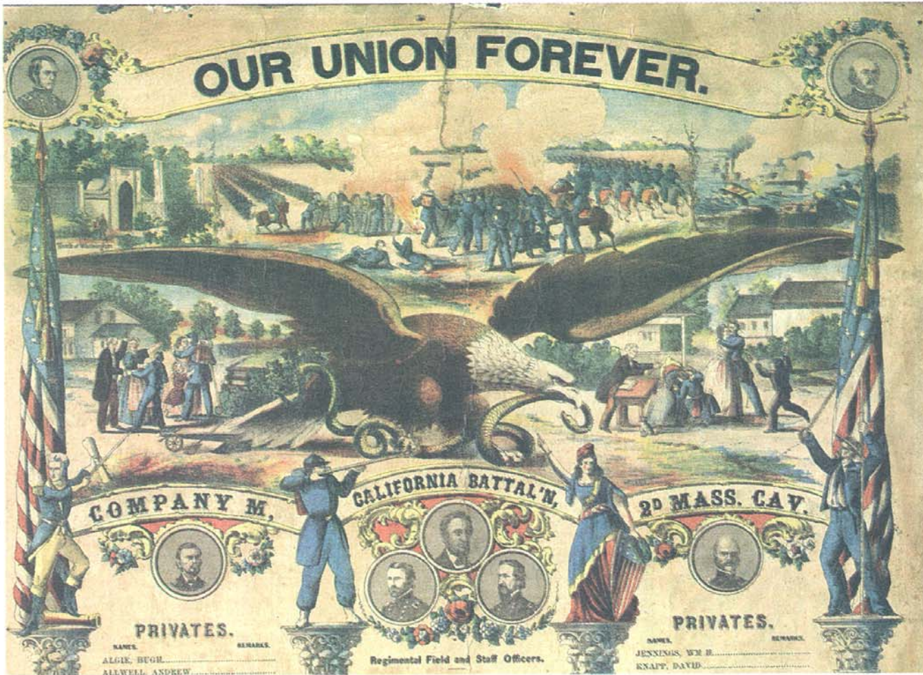
Left, Civil War-era artwork tying the 16th president's tumultuous time in office to California's early days; below, an image familiar to anyone who has examined a $5 bill.

For more entertainment and travel news sacbee.com