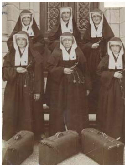
Six Sisters of Mary of the Presentation immigrated from France to North Dakota in 1902.