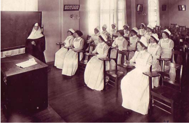
At the College of Nursing, students were taught by sisters, as seen in this 1911 photo of St. Mary's Hospital in San Francisco, CA.