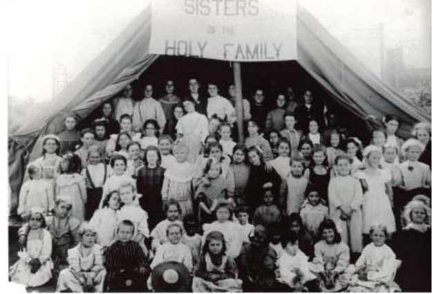
Sister of the Holy Family created temporary housing for refugees in response to the 1906 San Francisco earthquake and fire.