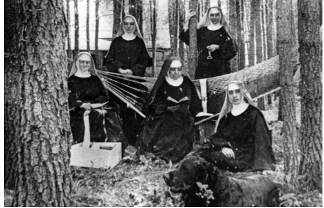
Benedictine sister overseeing the completion of St. Anthony's Hospital offered the first form of affordable healthcare in Bemidji, MN in 1900.