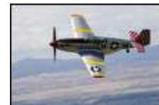
Wings of Freedom Tour