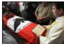
Funeral for teen farm worker