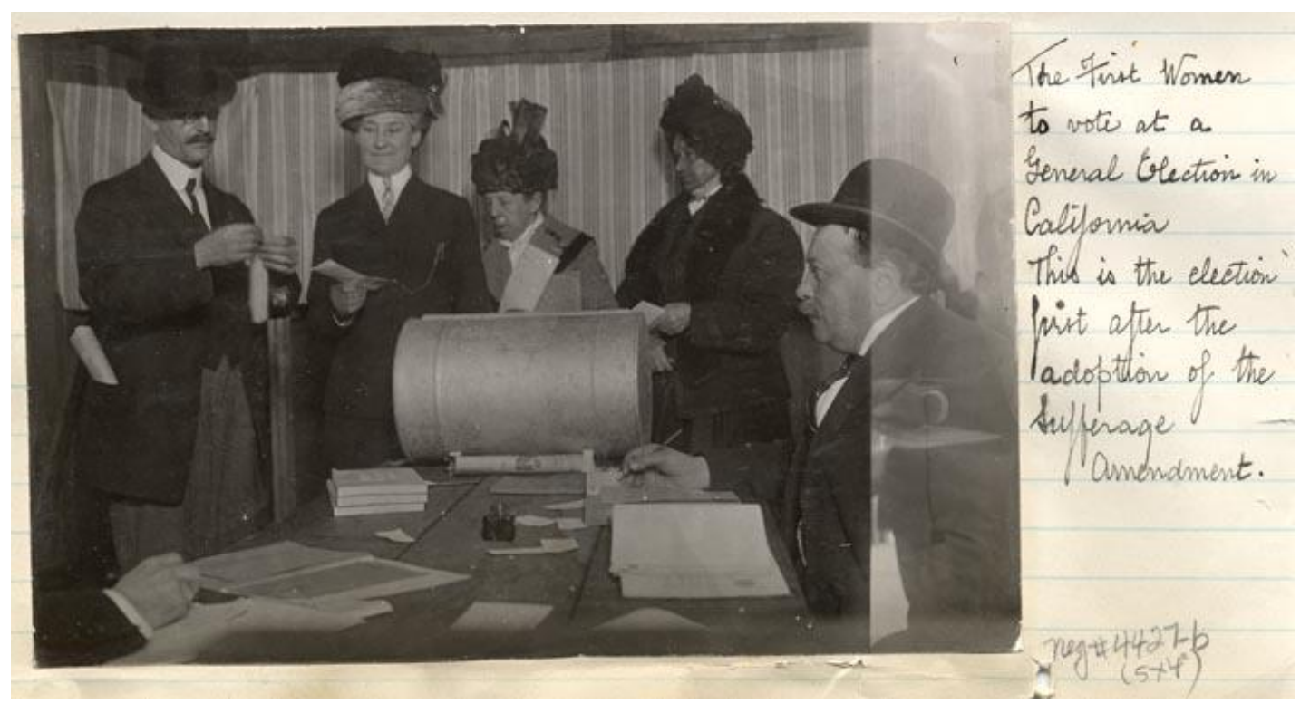
Photograph by Hamilton Henry Dobbin

View the photograph of the artifact and analyze it using the following questions.