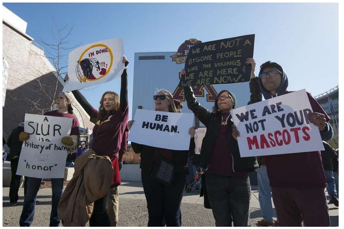
Protest against Washington football team, November 2, 2014.

View this photo of a 2014 protest against the Washington DC football team's use of a Native American as a mascot and a racial slur as the team name, and respond to the questions below.